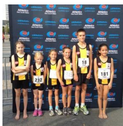
BLAC team from the Sydney 10

I don't know about you but I always thought the 'cross' in cross country described being angry. Generally the races were too far, had too many hills and it was always too cold, if it wasn't raining. That would make anyone 'cross'.